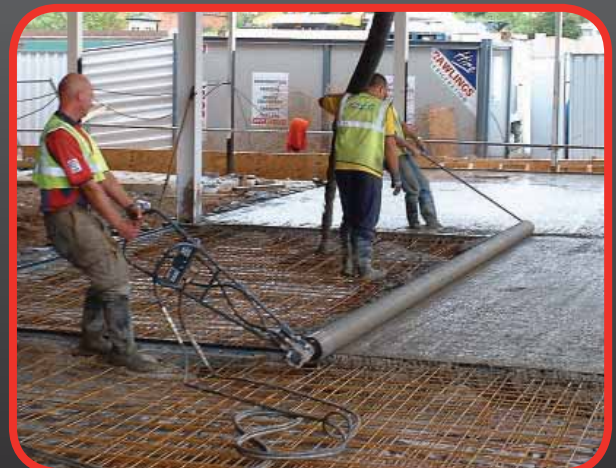
Leaves Aggregate Near The Surface For Excellent Strength