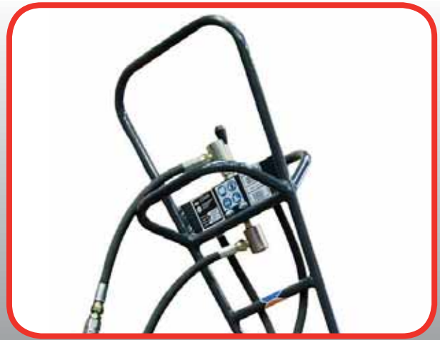
Low Maintenance Drive System